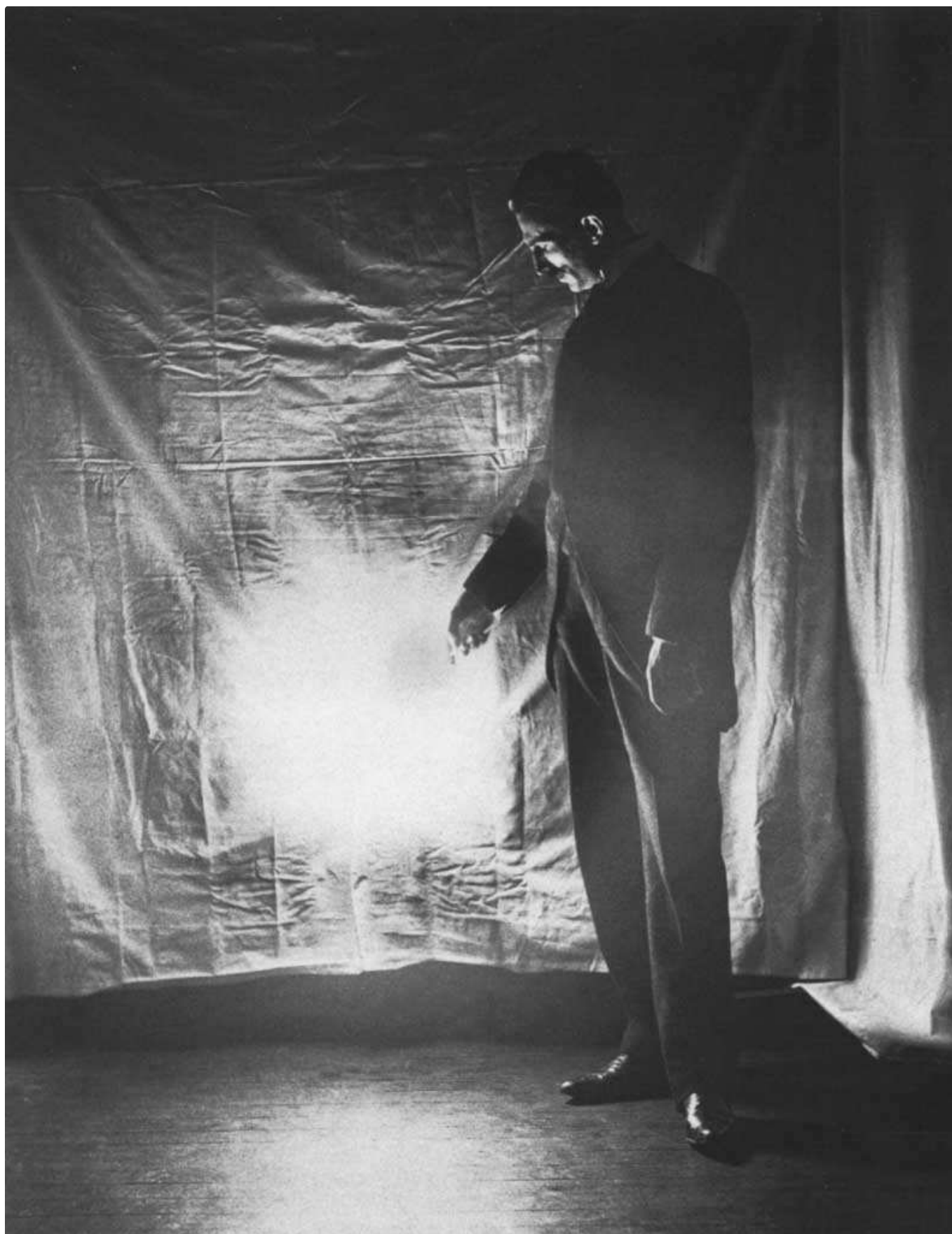
Tesla performs a test as he carries a lamp a few meters from the generator, but it continues to shine. The image was taken in 1898